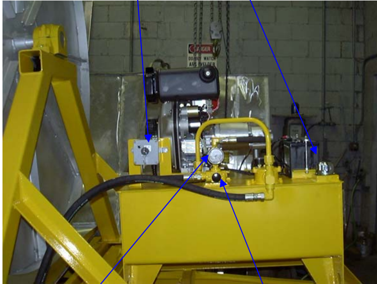
Pressure Gauge / Two Way Selector Valve