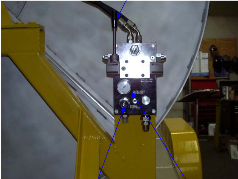
Reel By-Pass Valve / System Pressure