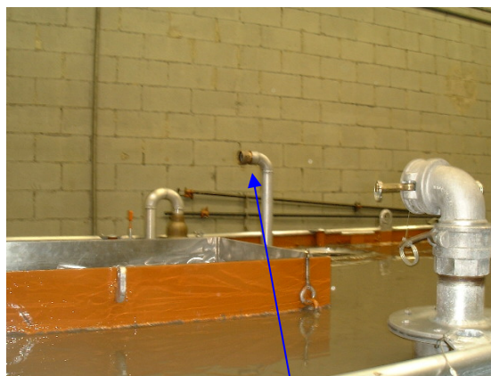
Fire Monitor Connection Coupling