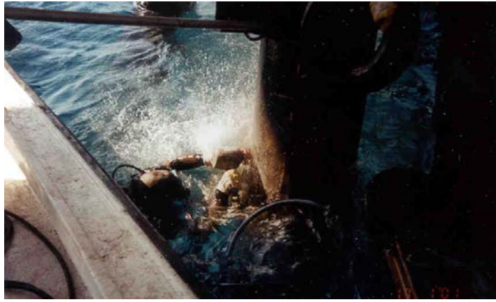
Diver using air driven "Whirlaway" to final clean pile