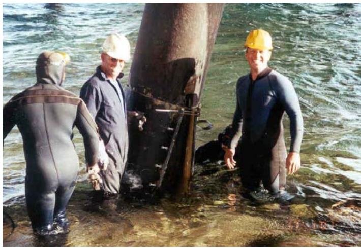
Wrap secured in place in surf