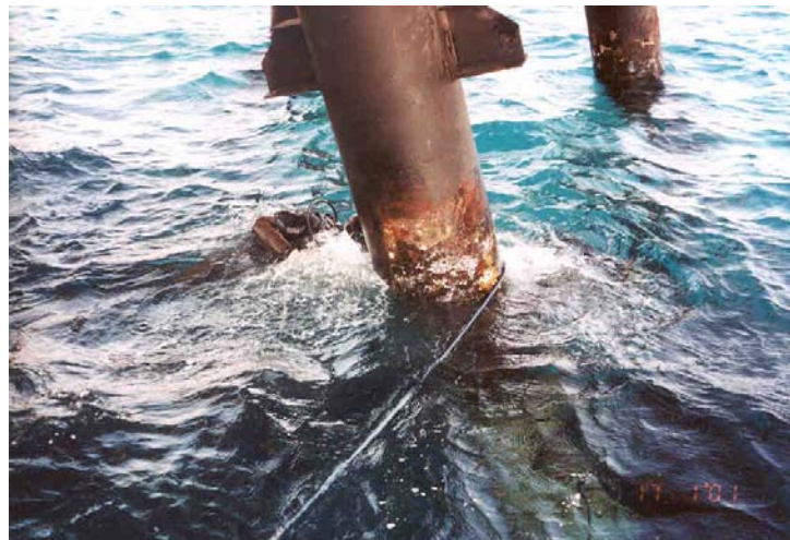
Underwater Pile Cleaning Operations

Pile Diameter's Range from 406mm – 1219mm