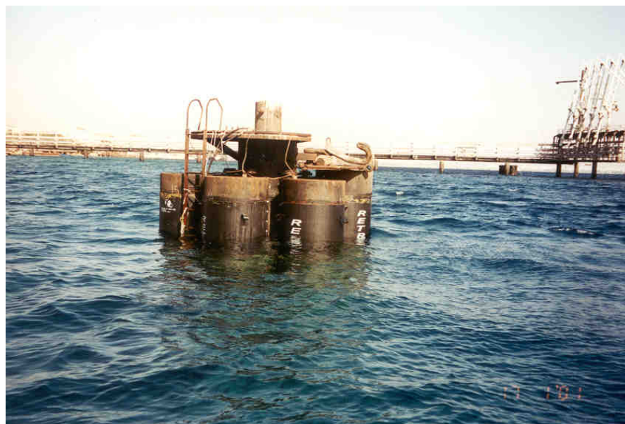
Complete assembly Jetty No. 1 in background

Corrosion Control International (Division of Slickbar Products Corporation) 18 Beach Street; Seymour, CT 06483 USA Ph: 203-888-7662 Fax: 203-888-7720 Email: info@corrosioncontrol.com ; Web: www.corrosioncontrol.com