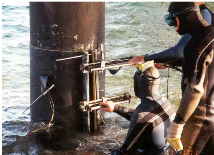
Tensioning operation in progress