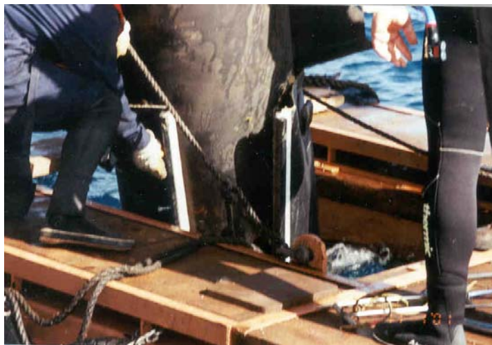
Wrap lowered into position using grab handles. Note inner sealing face of flange clearly visible