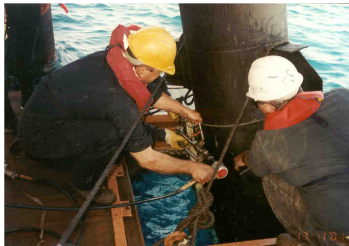
Tightening top caliper