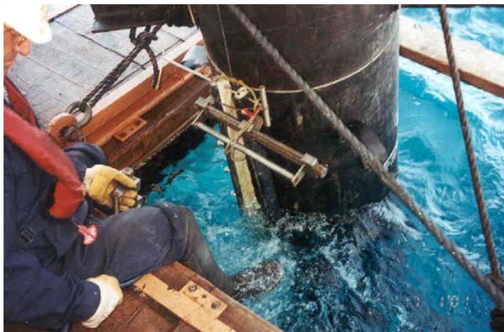
Line up rod and top caliper in position