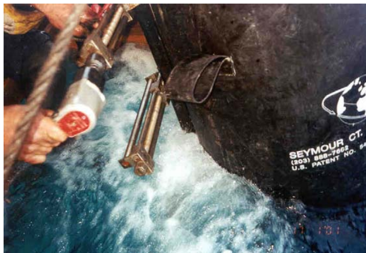
Underwater tensioning operation in progress