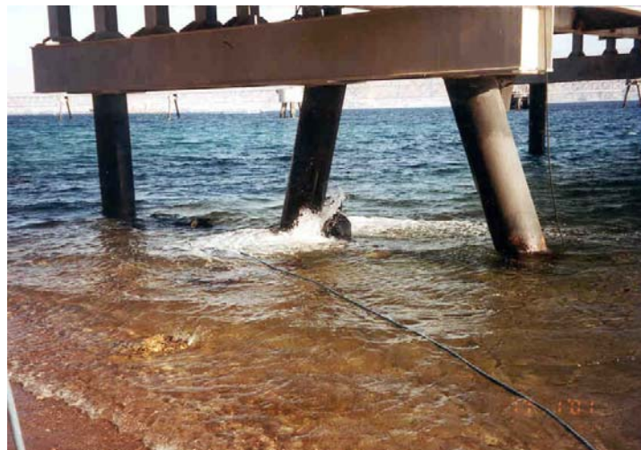
Inshore pile cleaning underway