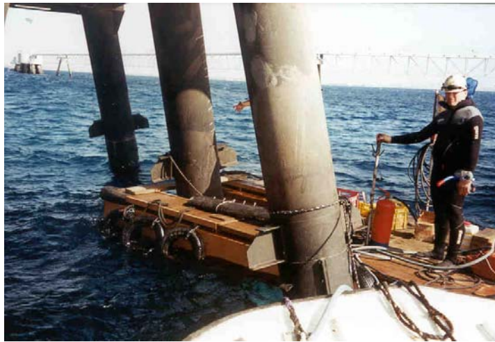
Self propelled work platform. Note wrap on deck, folded ready for installation - factory fitted fasteners clearly visible