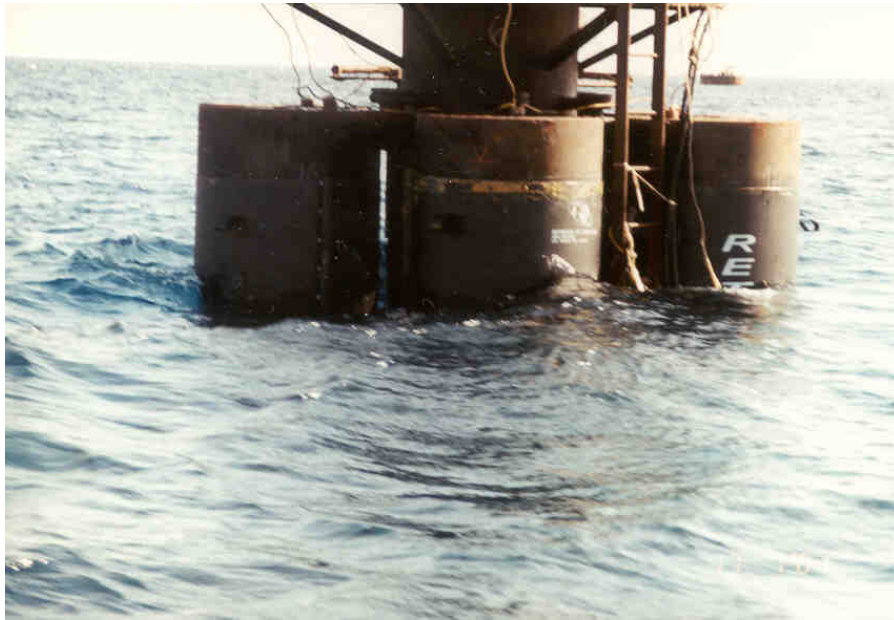
Large diameter one-piece wraps on mooring dolphin Note center wrap installed with less than 10" (250mm) clearance to outer piles