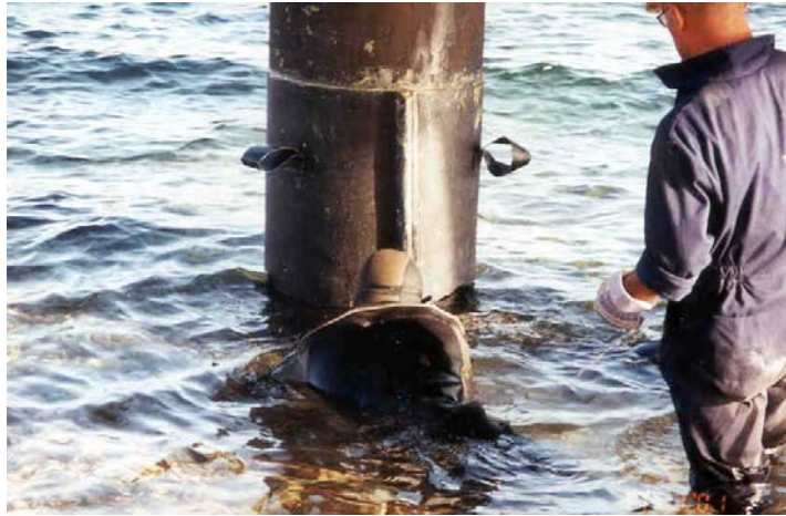
Wrap fully installed. Note: grab handle will be removed at this location