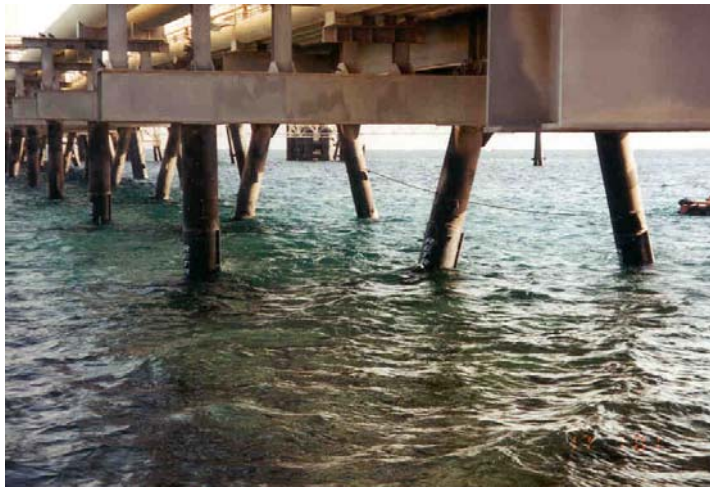
Installed wrap on vertical and batter piles