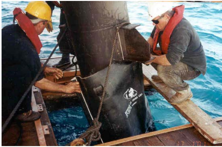
Line up rod being fitted