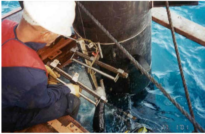
Second caliper being handed to diver