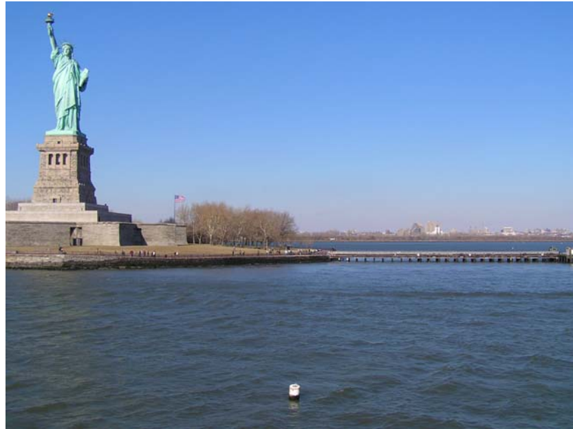
Liberty Island New York—February 2007

"CCI is recognized worldwide as a leader in the manufacture of high quality splash zone and sub sea corrosion protection systems, including a complete range of items for the offshore oil and gas industries!"