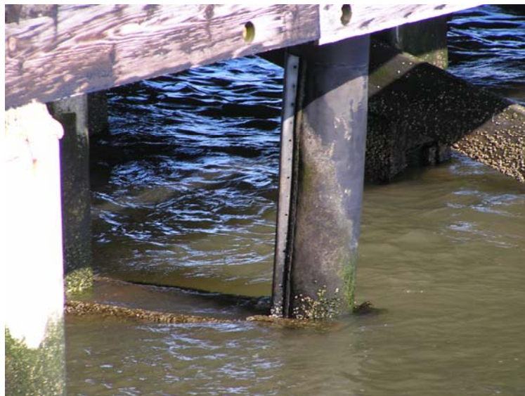
Low tide photograph of Retrowrap February 2007

These timber wraps were installed in 1998 and have withstood successive winters of freeze/thaw and impact from ice flows, floxom with prolonged exposure to UV on the above water sections. The highly elastomeric properties of the EPDM fabric "stretched" during installation to closely follow the contours of the pile totally eliminate water pumping action.