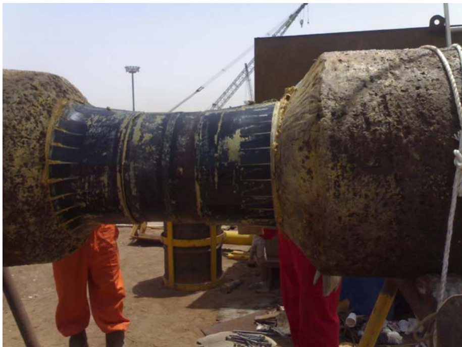
Retrowrap HD unbolted and removed from field joint showing adjustable end support collars and cohesive transfer of corrosion inhibiting gel onto pipe and concrete surface. Note no water ingress detected inside field joint assembly.