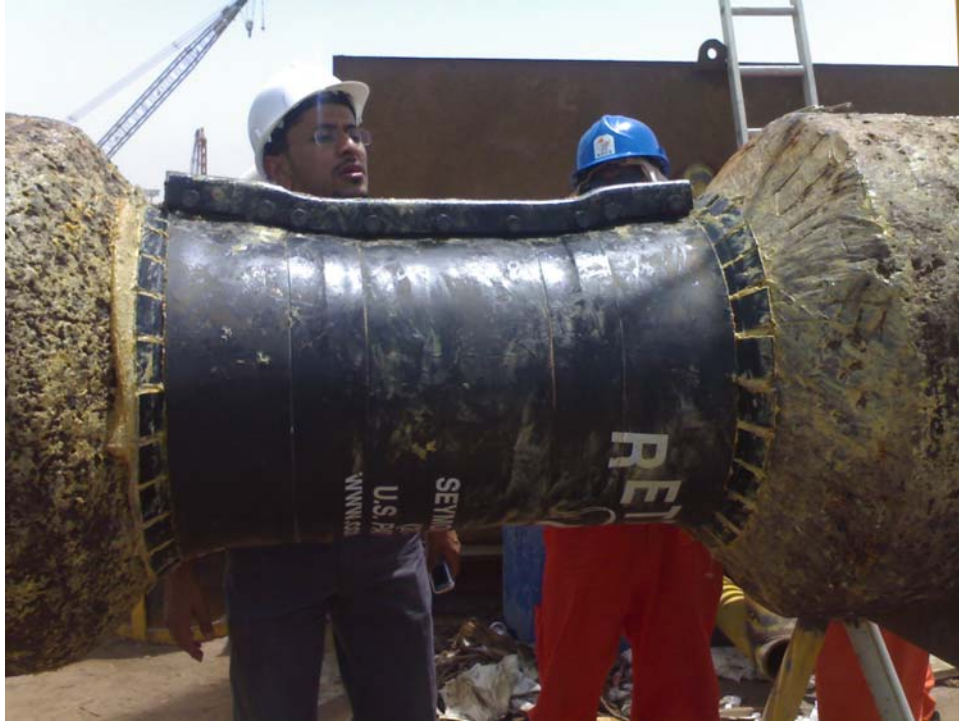
Dual diameter Retrowrap HD field joint cover removed from test tank prior to being dismantled