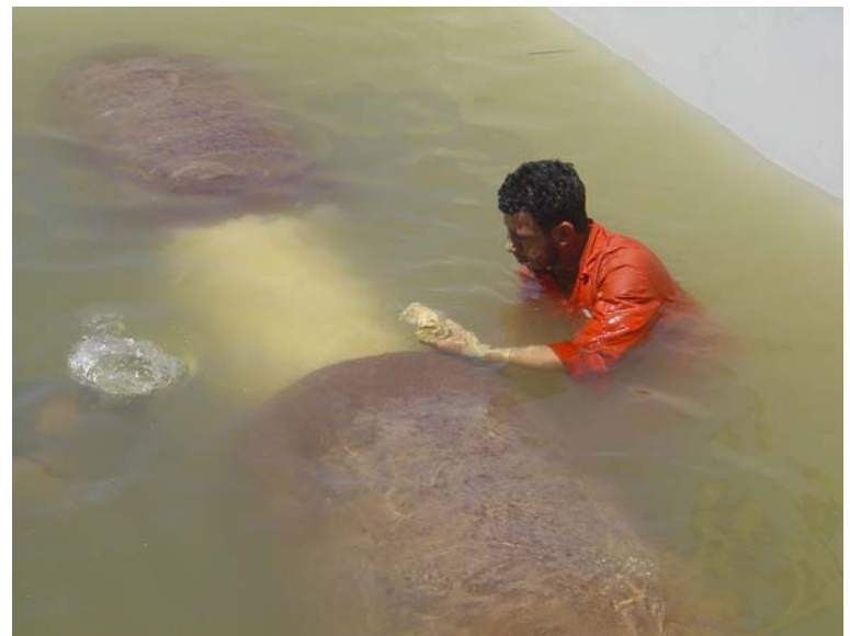
Application of hydrophobic Retrogel P to pipe joint weight coat before installation of adjustable end seals.