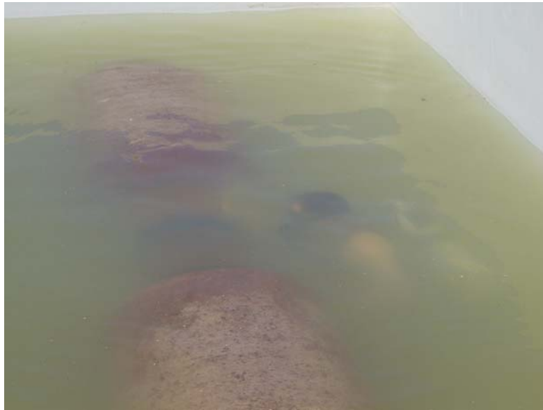
Diver cleaning the underside of a sample field joint and angular face of a concrete weight coat in test tank.