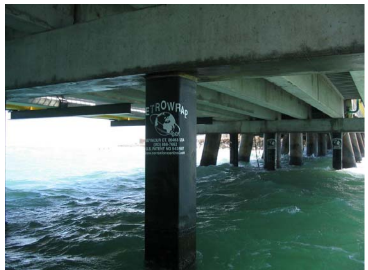
Pre-formed top seals are provided to accommodate any batter angle or vertical interface with the underside of the pile cap.