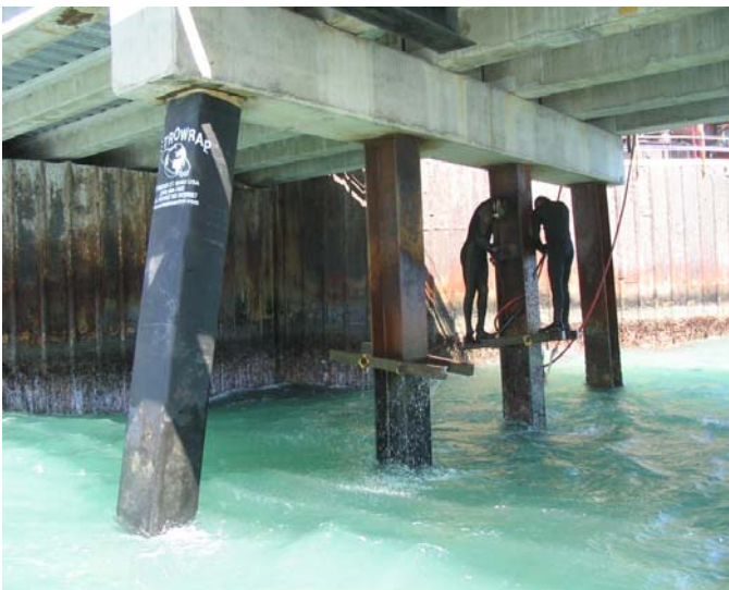
Temporary work platform attached to pile to permit up-pile cleaning and attachment of upper seal collar against pile cap

Foam polymeric filler blocks, shaped to be a push fit between the H pile flanges, are factory sealed and co bonded to the felt gel carrier. When installed, it is designed to wrap around the outer edges of the H pile flange and close against the flange outer surface overlapping the felt from the block fitted in the opposite side. When blocks are installed, the pile takes on a rectangular shape as shown below.